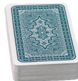
Deck of cards = 3 oz meat