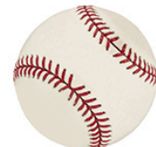
Baseball = 1 cup